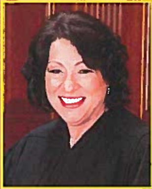
Sonia Sotomayor, Associate Justice of the United States Supreme Court

Over the course of this month, we will be sharing information with our students regarding the contributions of individuals of Hispanic heritage to our society.